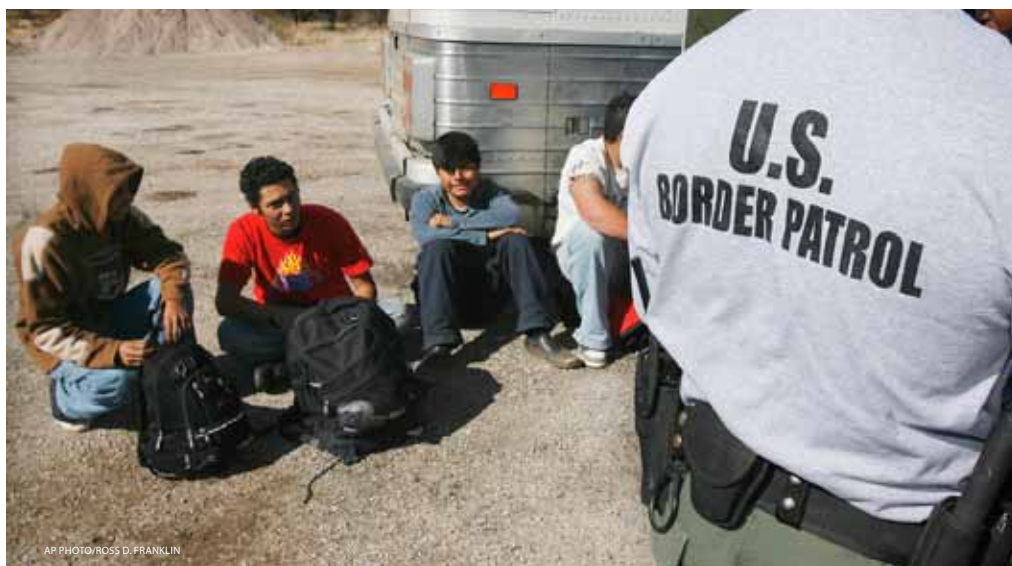
A U.S. Border Patrol agent processes a number of suspected illegal immigrants caught entering the United States.

Since CBP's creation in 2003, the agency has worked hard to gain effective control of the 1,950-mile U.S.-Mexico border by deploying a mix of resources and enforcement operations supported by intelligence activities.