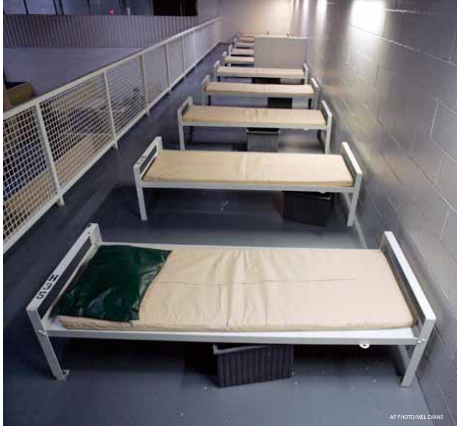
A row of beds at the Elizabeth Detention Facility, a Corrections Corporation of America immigration facility in Elizabeth, New Jersey.

without a hearing before an immigration judge. This new policy applied to those immigrants apprehended within 100 miles of the Mexican or Canadian borders within their first 14 days in the United States. The expansion of expedited removal has been somewhat controversial in some quarters due to concerns about whether individuals receive fair consideration of their situations. But it demonstrates the heightened level of seriousness and commitment to enforcement that has taken root over the last several years.