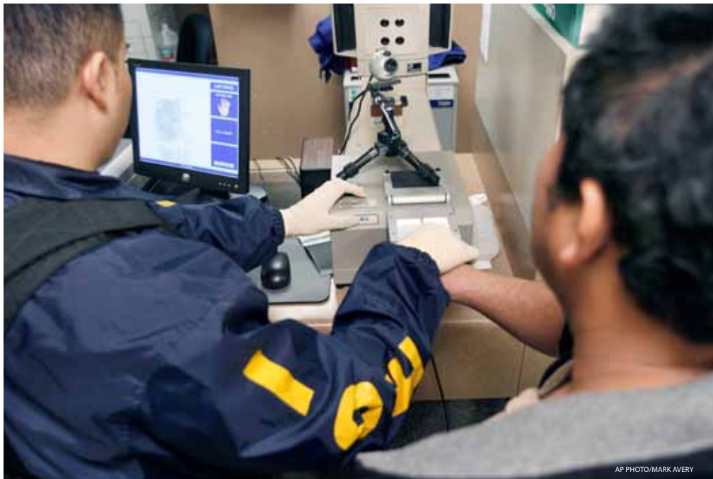
Suspects are photographed and fingerprinted by an Immigration and Customs Enforcement officer.

For many years, immigration enforcement officers have been able to access an immigrant's criminal history information after fingerprinting them. Law enforcement officers, however, have not had the ability to simultaneously receive both the immigration status of an individual as well as the person's criminal history