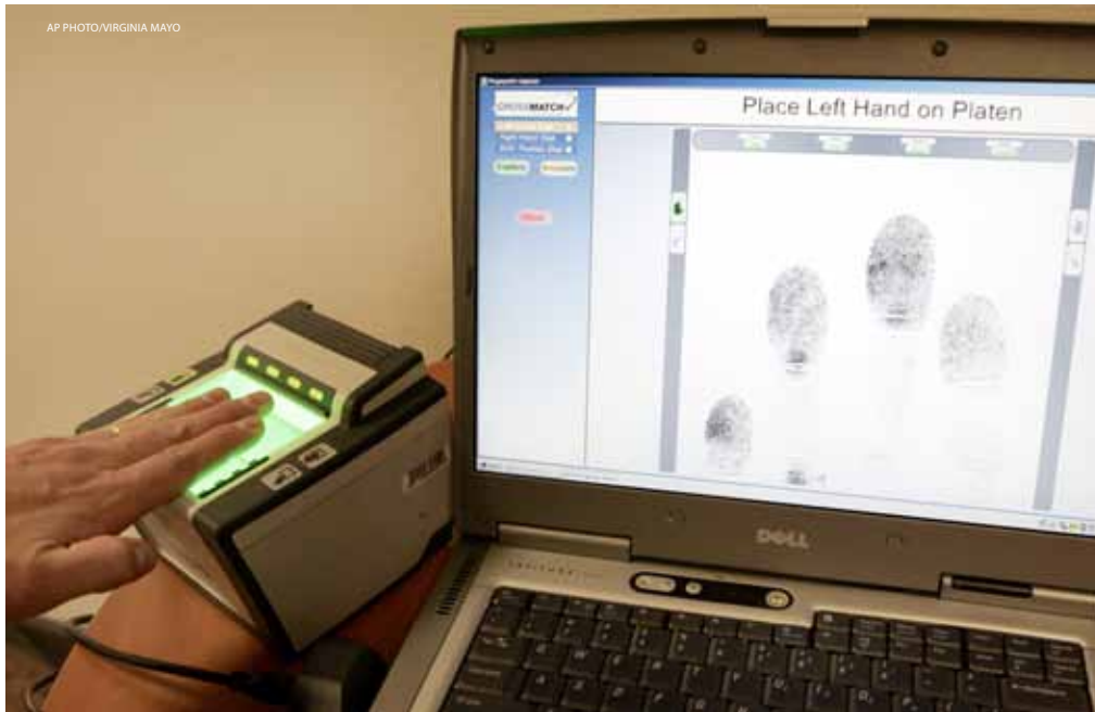
A man demonstrates the new 10-fingerprint scanner and its output on the computer.

metrics, and the State Department identifying thousands who are ineligible to receive visas to travel to the United States. 29 There is little doubt that the program has deterred countless more. Further, it has helped not only consular and CBP officers adjudicate visa and entry applications, but with the addition of USCIS data in the DHS Automated Biometric Identification System, or IDENT, USCIS benefit adjudicators can now identify immigration benefit fraud through the use of biometrics.